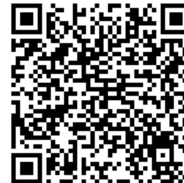
Figure 2. Four sample items from the PAS-SS. An image of the entire survey can be found using the QR code.

I know I can make a difference in my community